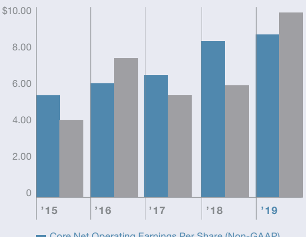
EARNINGS PER SHARE (For the year ended December 31)

AFG's overriding goal is to increase long-term shareholder value.